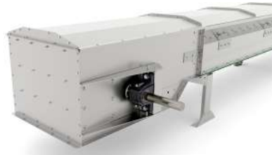
Split pillow block bearings for simplified assembly and maintenance.