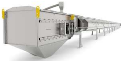
A manual spindle tensioning system can be combined with a 750 mm supplementary case to accommodate larger belt tensioning needs.