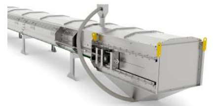
Material that falls from the upper conveyor section is transported back to the end of the conveyor by the returning belt. A specially designed hopper collects the material, which is then conveyed back to the upper part of the belt via a dedicated tubular spiral conveyor.