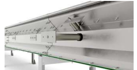
All rolls can be easily inspected, maintained, and exchanged from the outside.